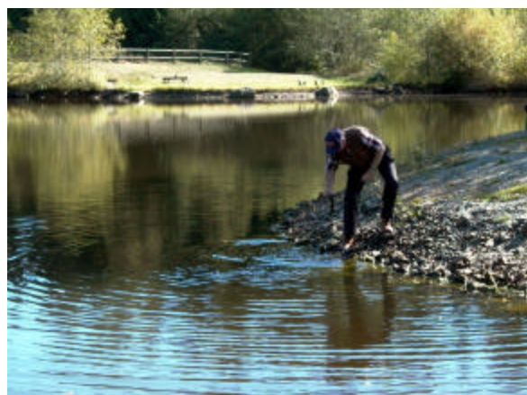
And releasing a nice rainbow.