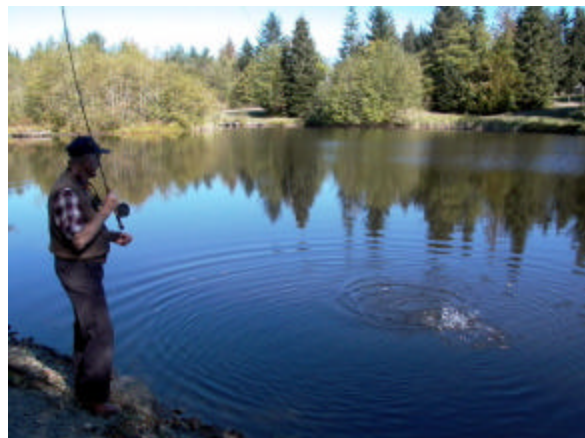
Keeping his rod up.

By order of the Board of Directors, I hereby give notice under paragraph 14 of the constitution and by-laws of the Island Waters Flyfishers Society, that the Annual general Meeting of the Island Waters Flyfishers Society will be held on Tuesday, November 25th, 2003 at 7.30 pm. in the Ukrainian Hall, 4017 Victoria Avenue, Nanaimo, B.C.