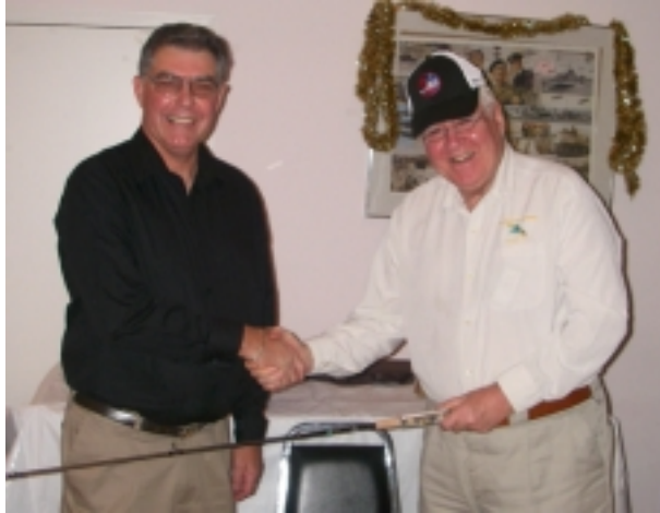
At the Christmas Dinner and Auction there were coveted prizes..