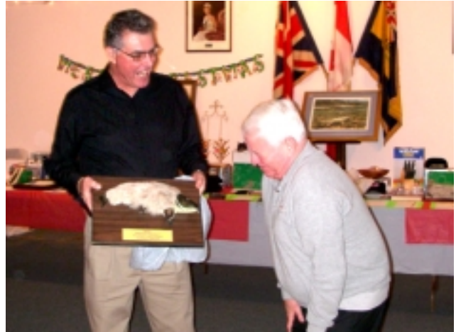
And there were booby prizes!