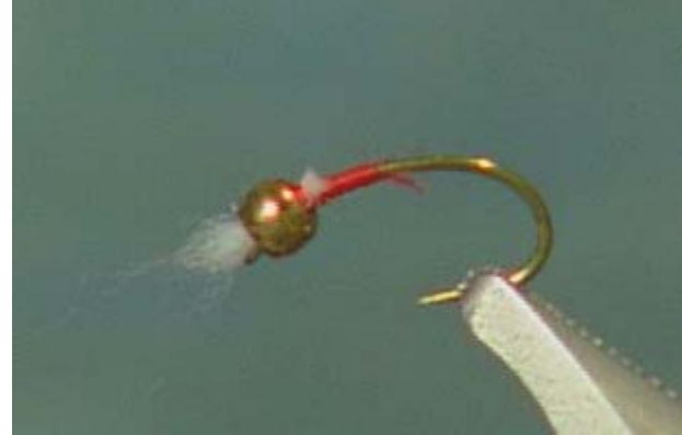
Step 3: Tie on thread and wrap a small red butt on the hook

Step 2: Slide bead onto hook with the larger bead hole towards the eyelet.