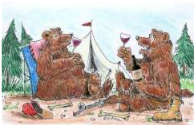
I finally remembered—red with hunter, white with fisherman.

Visit the BCFFF on their webpage at http://www.bcfff.bc.ca/