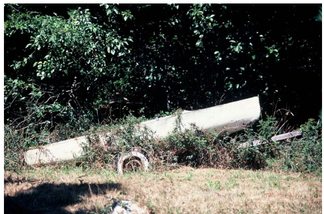
Peter's best advice of the evening: You got to get out more!