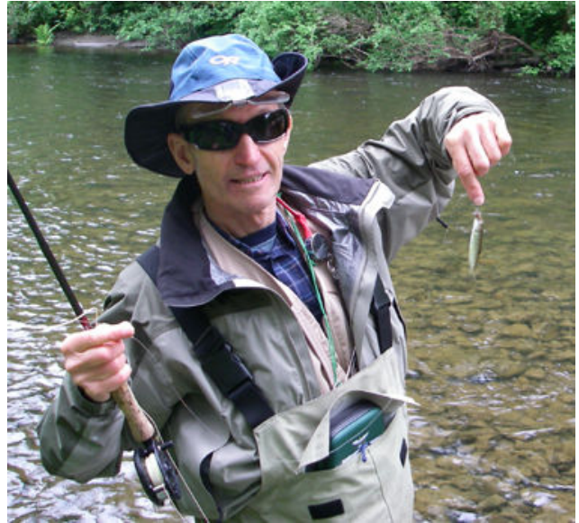
Who's coming for shore lunch?