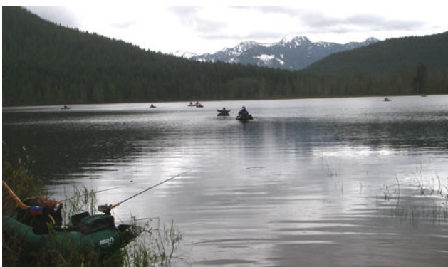
Some of the 17 members at the May 22, 2010 Fishout at Panther Lake