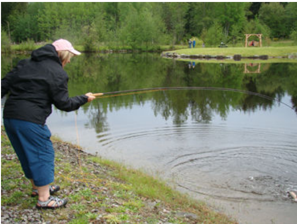
Cathy was into one