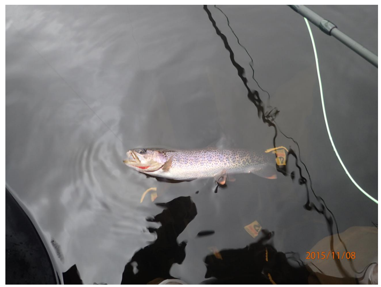
No hatch whatsoever. There was bit of shooting going on. I was hoping for no stray bullets. We had a good day.