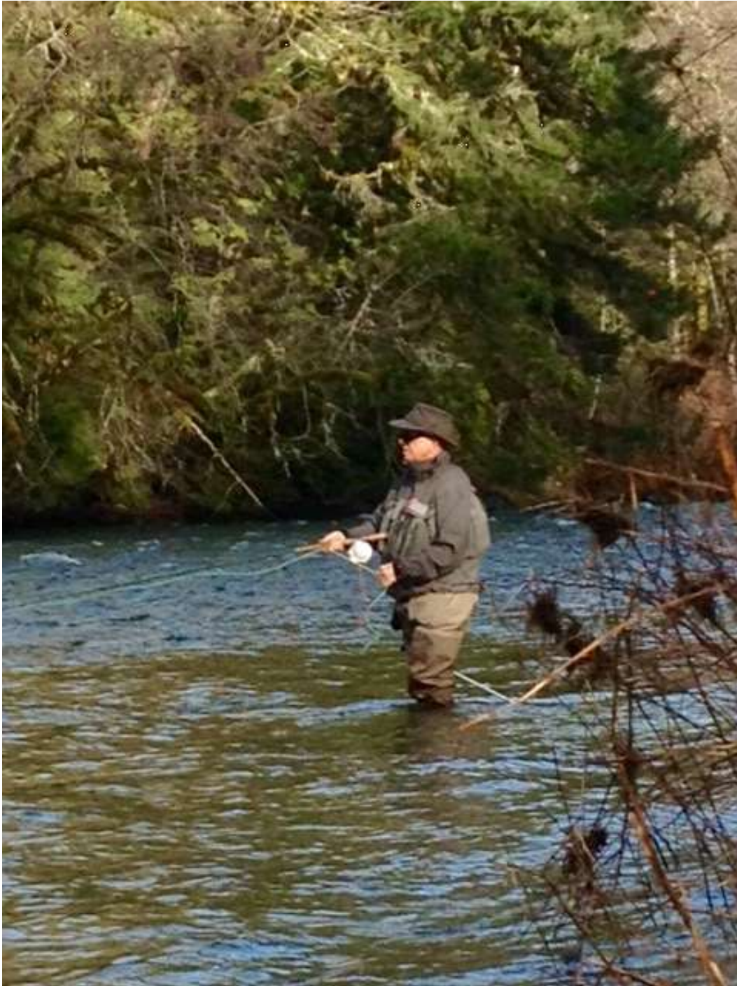
Tye fishing Spring Pool

Hi Folks... Tye and myself went to the Cowichan River last Friday to explore what was in the river. The day was spring like, with sun and warm temperatures. The river was running @1.3m which is perfect for this time of year. We fished Spring Pool and Cabin Pool and were the only fishers in the area. We found Coho in Spring Pool, one hooked and lost and a nice 17" Rainbow at Cabin Pool. Great day! The river is high again with the latest rain and no signs of any steelhead in the upper river. Tight lines