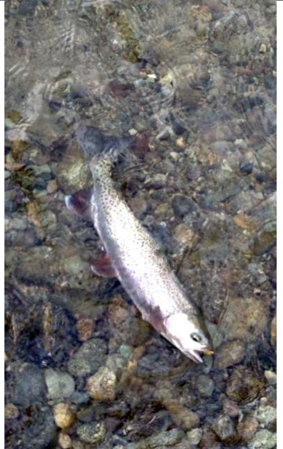
Cowichan winter rainbow