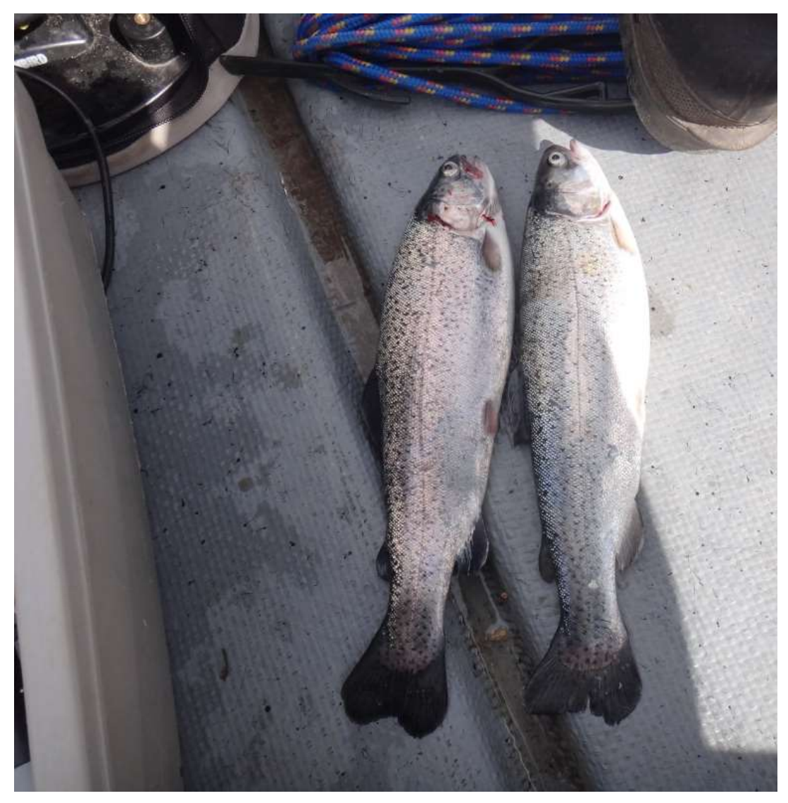
Supper! Two fat 12 inch rainbows from Green Lake

We are both looking forward to the trip to Kissinger next week and will be heading over together on Friday morning.