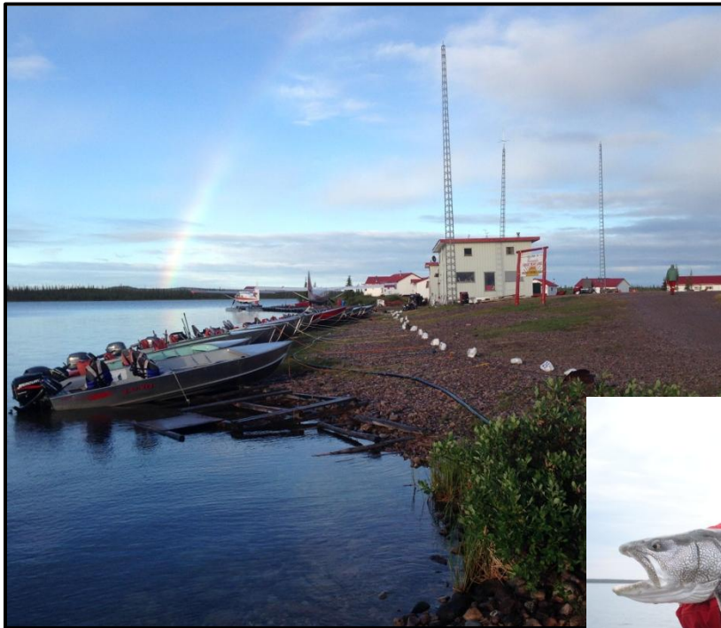
Above: Great Bear Lake lodge