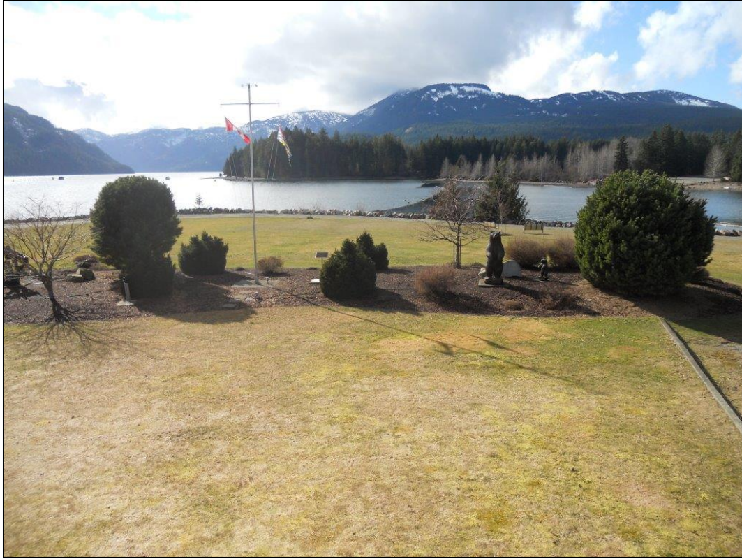
Courtenay Fish and Game Club on beautiful Comox Lake.

Directions to the Property: also see map following.