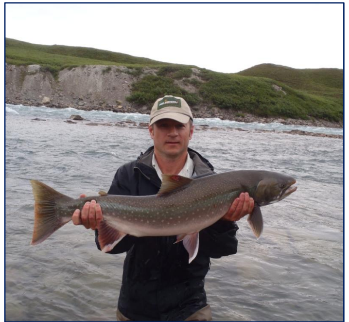
Arctic char from the Tree River