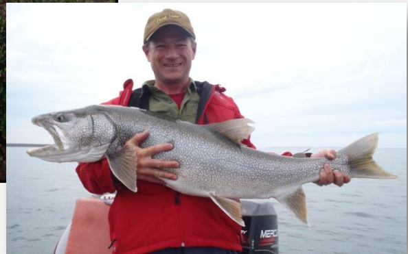
Right: Lake char from GB Lake

The Lake Trout (or Lake Char if you prefer – they actually are a kind of char, but they are rarely called that) are so well adapted to the cold clear water of the lake that they have diversified their habits, and several subspecies have evolved. Red-fins eat smaller prey items such as caddis and smaller bait fish, there are deep water trout that are rarely seen, and butterfly lake trout that have pectoral fins up to 10 inches long. The king predator is the grey lake trout – an eating machine that can swallow a fish up to 30% of its own body weight. These greys reach weights of up to 60 pounds – with a world rod and line record over 70 pounds, from Great Bear Lake. In 2013, one was netted that was claimed to have weighed over 80 pounds (no official weight was recorded).