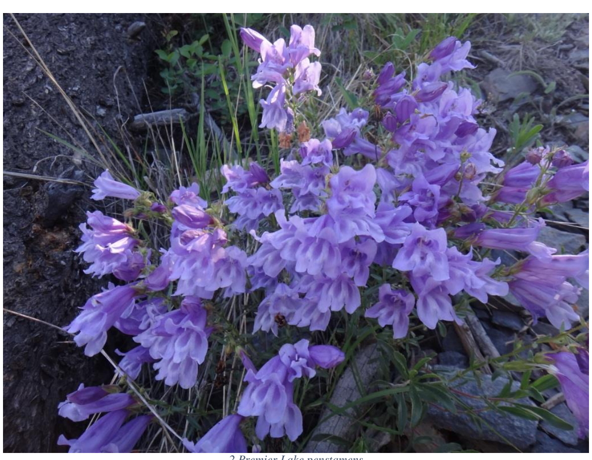
2 Premier Lake penstamens