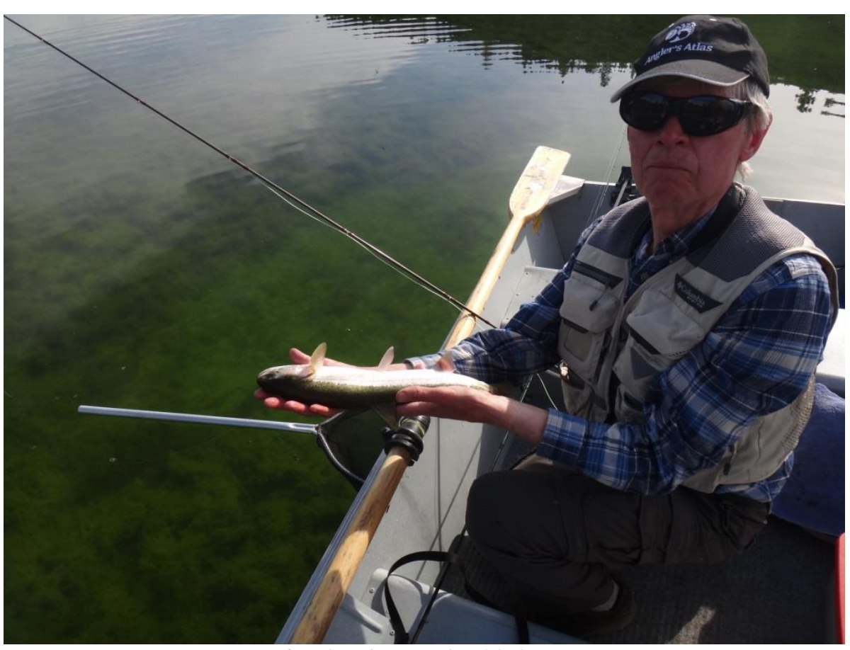
6 Larchwood trout caught in 3 ft of water.