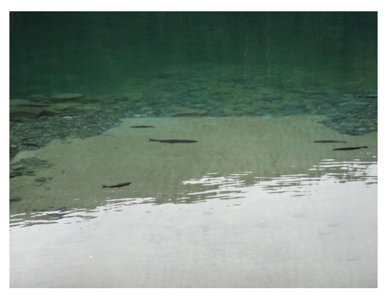
1 Premier Lake spawners at launch ramp