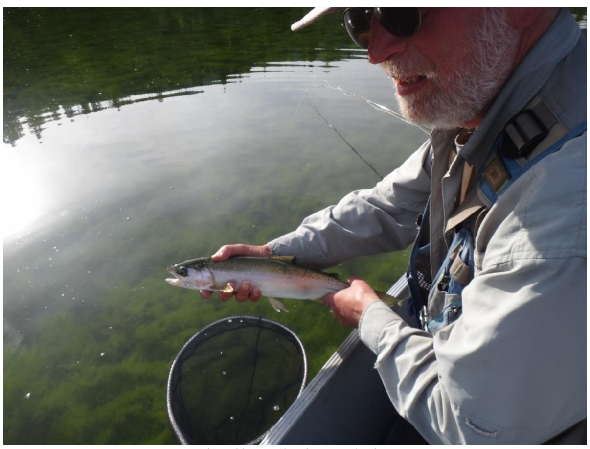
5 Larchwood lagoon 18 inch trout on leech pattern