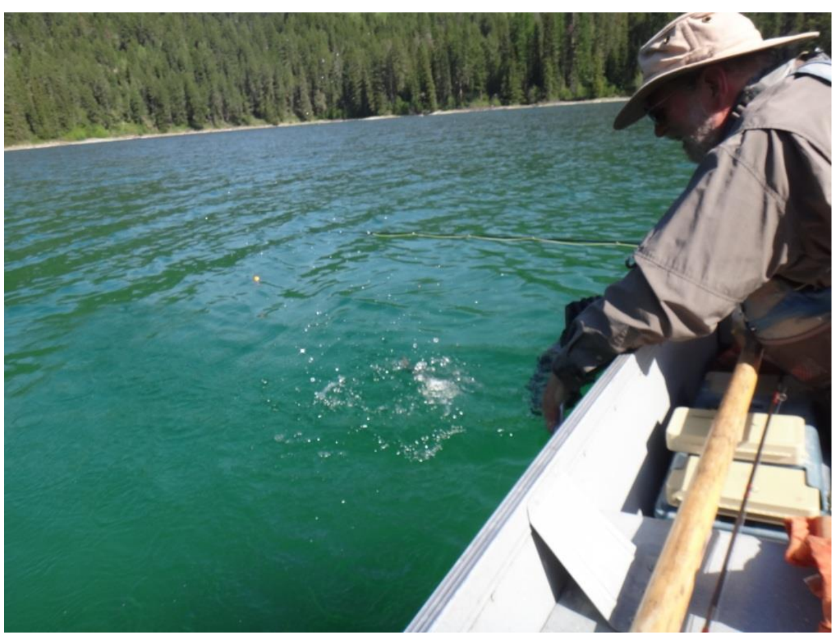
3Alsace Lake pennask bring shy about a photo op