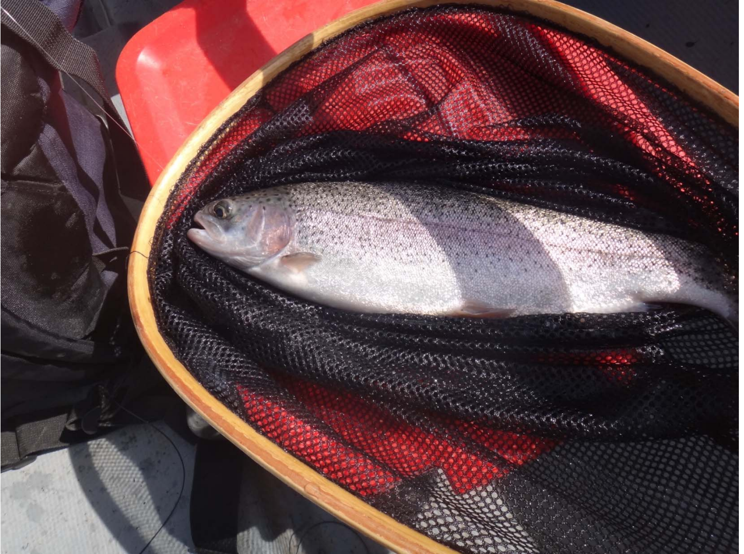
14 inch Diver Lake catchable (caught in April 2015)

The fishing improves again in the fall as the water cools. Fishing near the launch ramp after the fall release of catchables can produce some good catches.