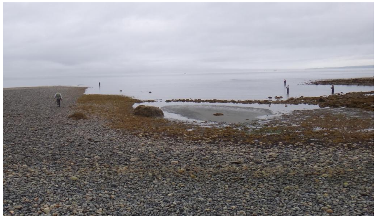
Arriving at Keogh Estuary on an Ebbing Tide

We heard from a few people at the campsite that the Keogh had some willing fish so spent two days up there having excellent fishing both days.