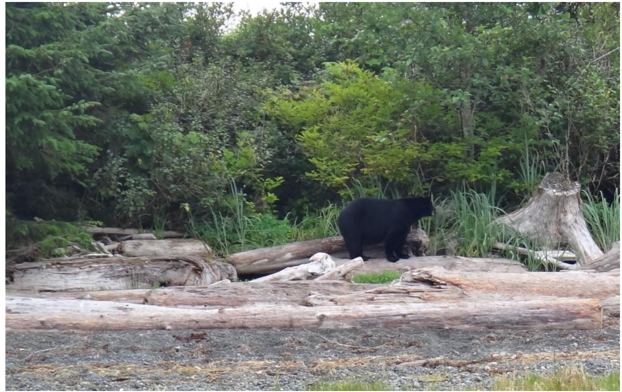
This Hefty Briun looks like he's had his share of Pinks

The black bears provided some diverting moments, with Mom teaching junior how to catch the fish heading up above the little waterfall. Not sure how many fish have gone up the river so far.