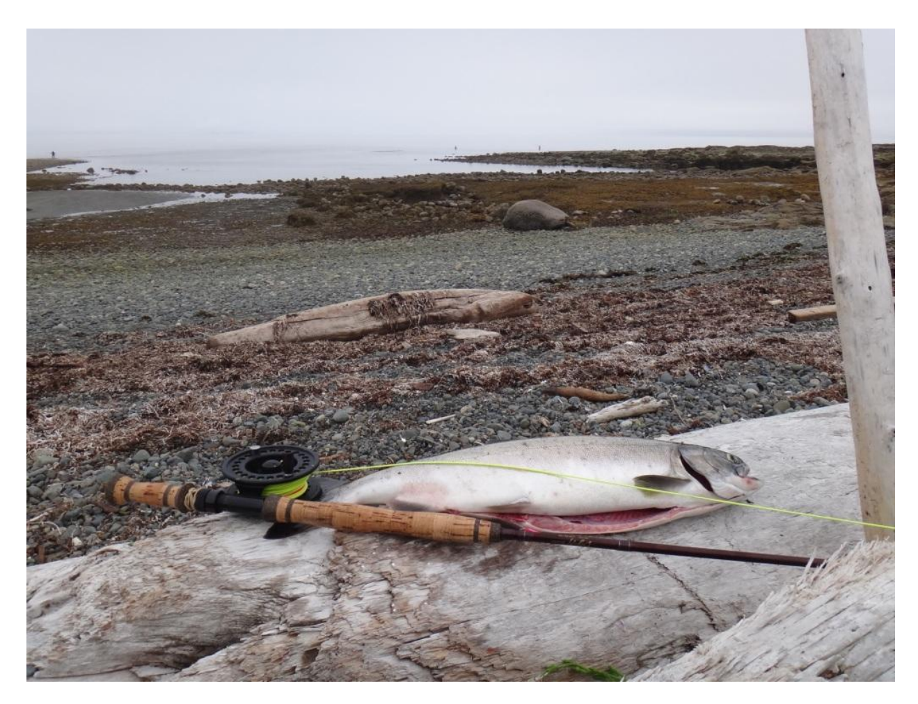
Bright Pink caught on ....what else.... A Pink Handlebar ...

Even though there was some good fishing to be had (the fish were definitely more willing to bite than the Eve fish), the numbers were extremely low for what should be a major year for the river. Probably under a 1000 fish in the whole area where there should be 50 or 60