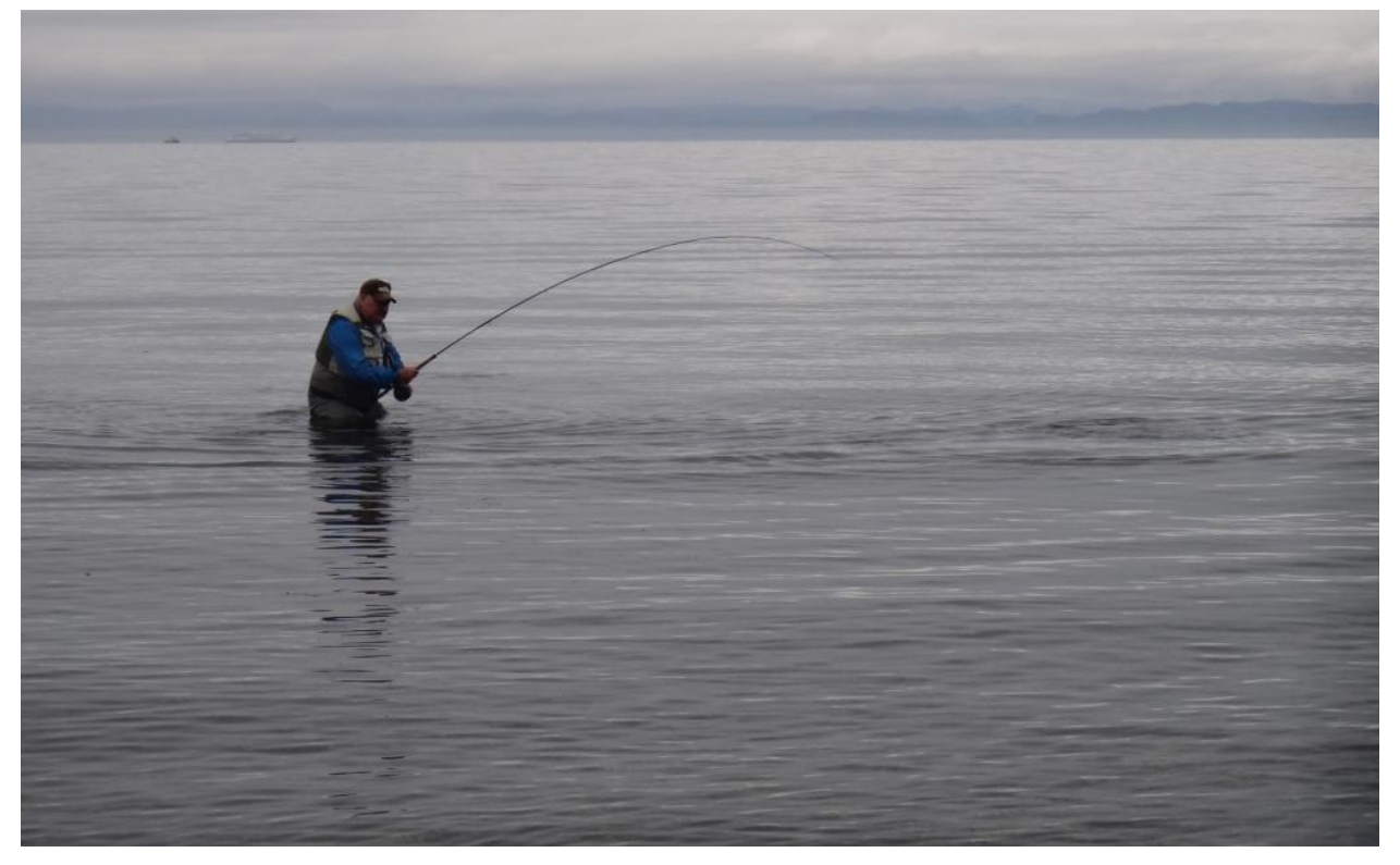
Wearing down a Pink prior to releasing it

The fish up in the estuary were very close mouthed with few fish caught. We had to fish out in the chuck away from the estuary where the fish were often a long cast from shore. Usually they would bite if you could drop a fly near the school but many times the cast was too long for