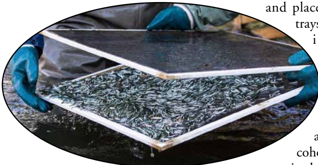
Look out, Englishman River! Here come 800,000 feisty pink fry!