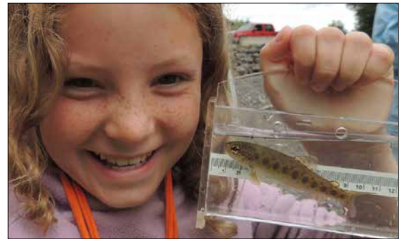
You're never too young and you're never too old... be a streamkeeper!

The participants come out for one class, one weekend; the trainers know that those who spend their free time taking the streamkeepers training are