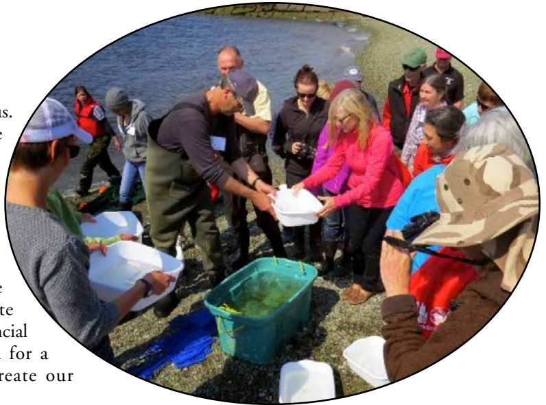
The workshops were "rain or shine", and we were glad that it was mostly "shine".

Next morning, after a great breakfast catered by Carmoors Cookery, the learning began. For those new to salmon enhancement, there were sessions on how to get started, while others provided in-depth information for experienced enthusiasts. Session titles included Aquatic Invertebrate Studies, Egg to Fry, Fry to Release, First Nations Programs that Work, Riparian Restoration, Salish Sea Marine Survival Program, Watershed Roundtable, Adult Broodstock, Digital Camera How-to, Early Marine Survivals, Fish Dissection, Fisheries Protection Program, NGOs, Stock Assessment, Stream Restoration, DNA Tagging, Engaging Volunteers,