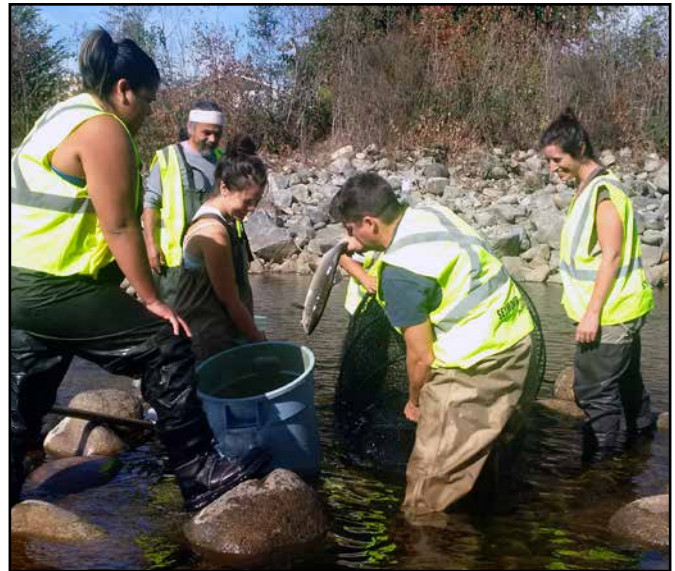
Crew uses a hoop net to collect salmon on the Seymour River.

Sharee Dubowitz, Seymour Salmonid Society