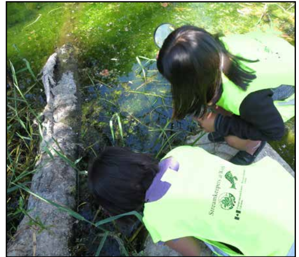
Young scientists in official streamkeepers vests get deeply involved in their home stream.

The streamkeepers were given the green light to incubate coho in the