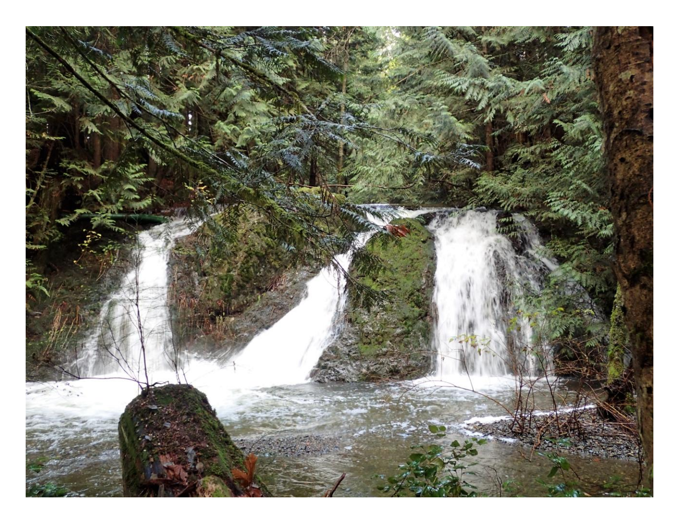
PHOTO 4 (above) was taken yesterday on the upper McGarrigle creek. Normally there is only a little water coming over the center fall but with all the rain it was just gushing.