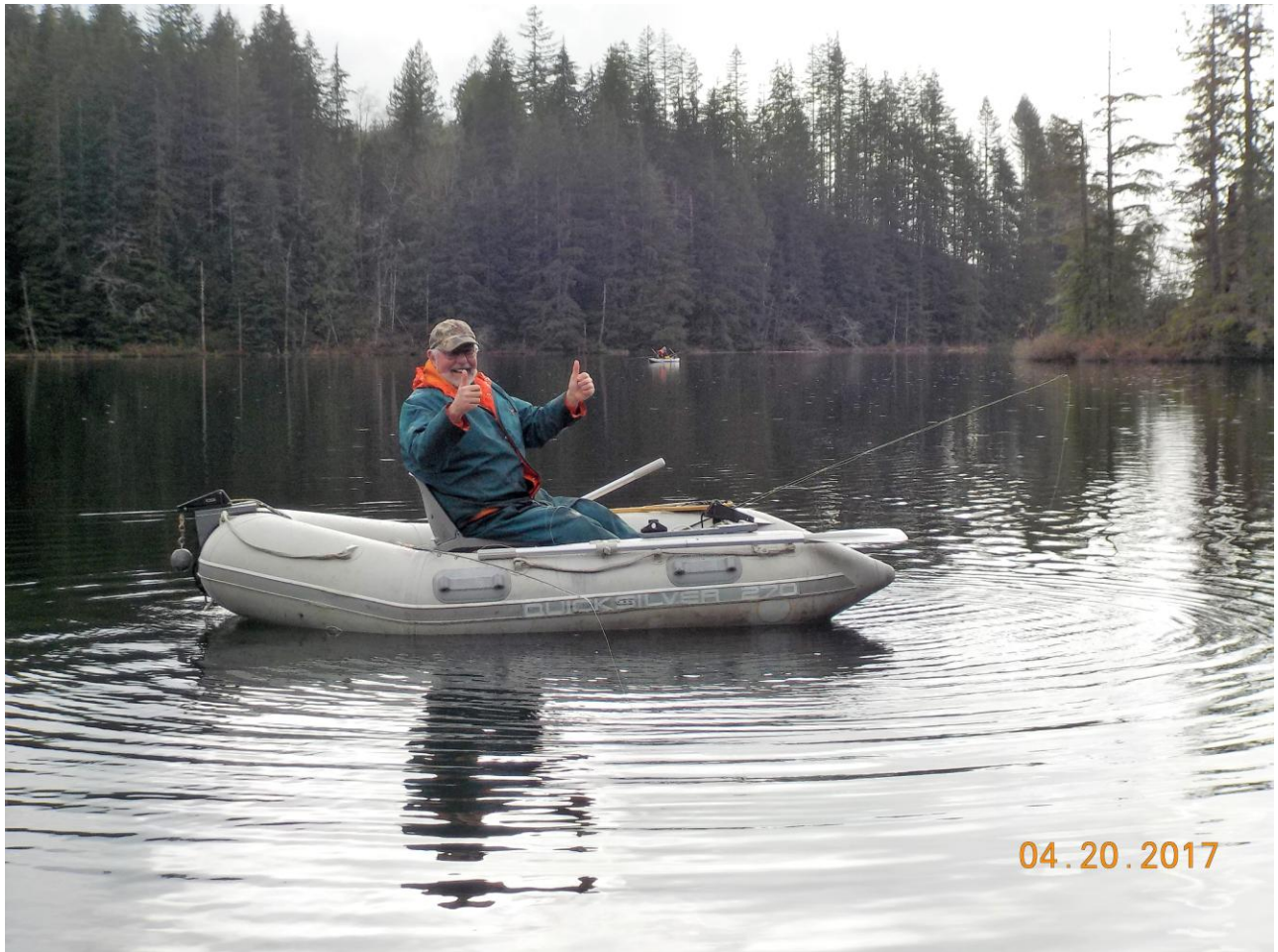
A Jack released Rainbow....his was bigger than all the rest....