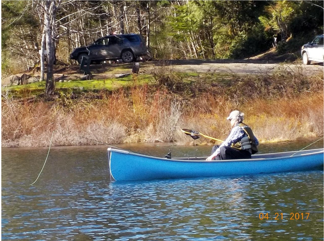
An Ian caught Rainbow