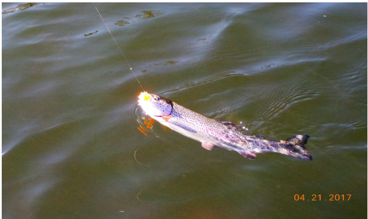
A Blob caught Rainbow

Water temperature for the extended weekend was 10 – 12 °C and the fish were actively biting on everything most of the time. Thursday was mainly emerger day when dries were fished both wet and dry and everyone did well. Friday, during a slow period, Ian switched to a boobie and/or blob pattern and the bite was back on big time. Then later in the afternoon or evening Jason started fishing a pumpkin head pattern and the bite was continuous through to Saturday afternoon when the rains came and forced all but Matt and Buschie off the lake to start the party. Sunday was another perfectly sunny, calm fishing day for anyone still standing. What happened at Kissinger Lake stays at Kissinger Lake hopefully. In the meantime here are a few pictures to show: