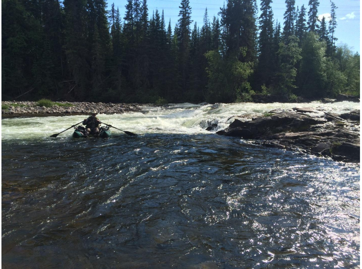
Final Photo op before heading downstream....