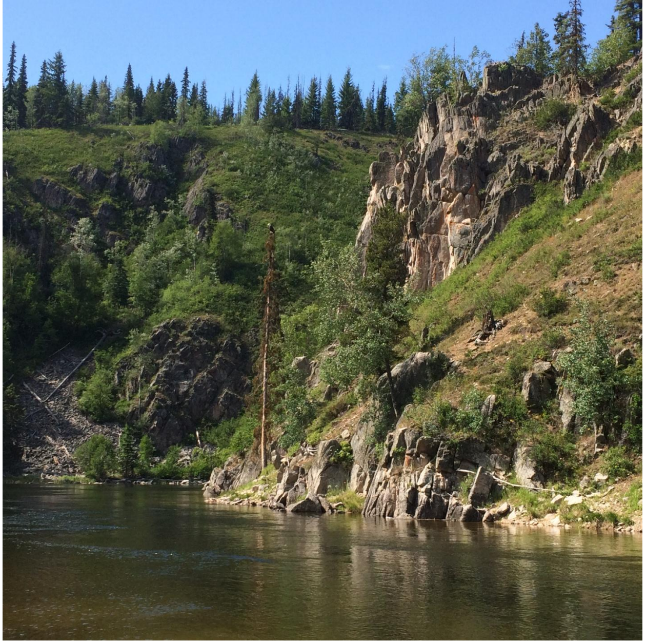
The Watch...no more COs ...just Eagles