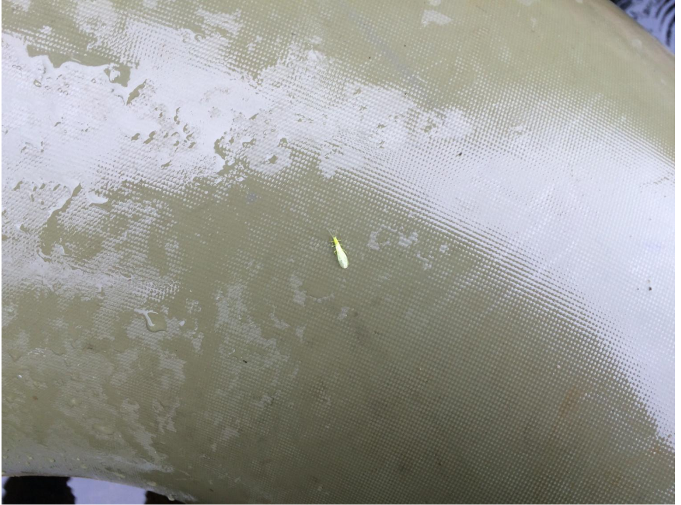
Yellow Sally Stonefly