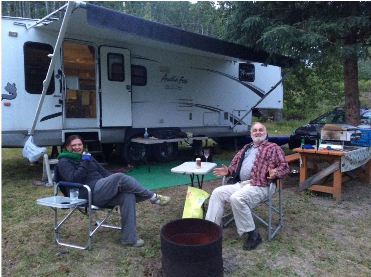
The Welcoming Committee at the Stellako Lodge Campground

Wow, great information for a great trip. I tied feverishly for about 2 weeks leading up to the trip north. I totally under estimated the time driving and arrived late in the evening before the "BIG Day".