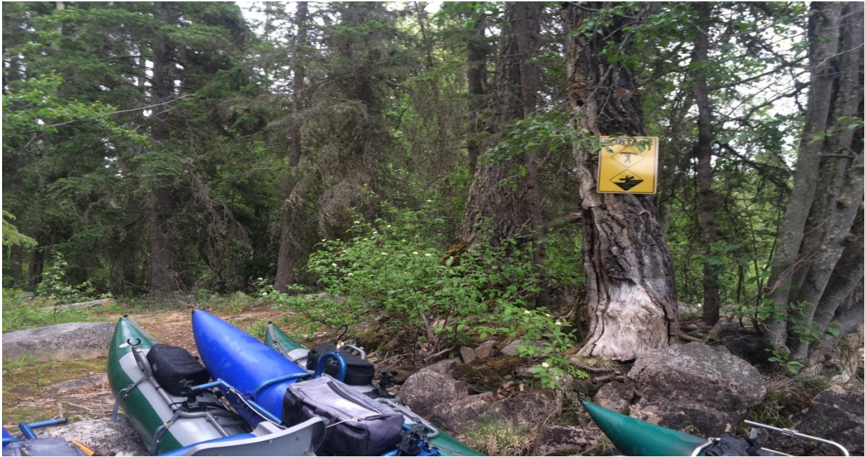
Another view of Portage Trail from water's edge