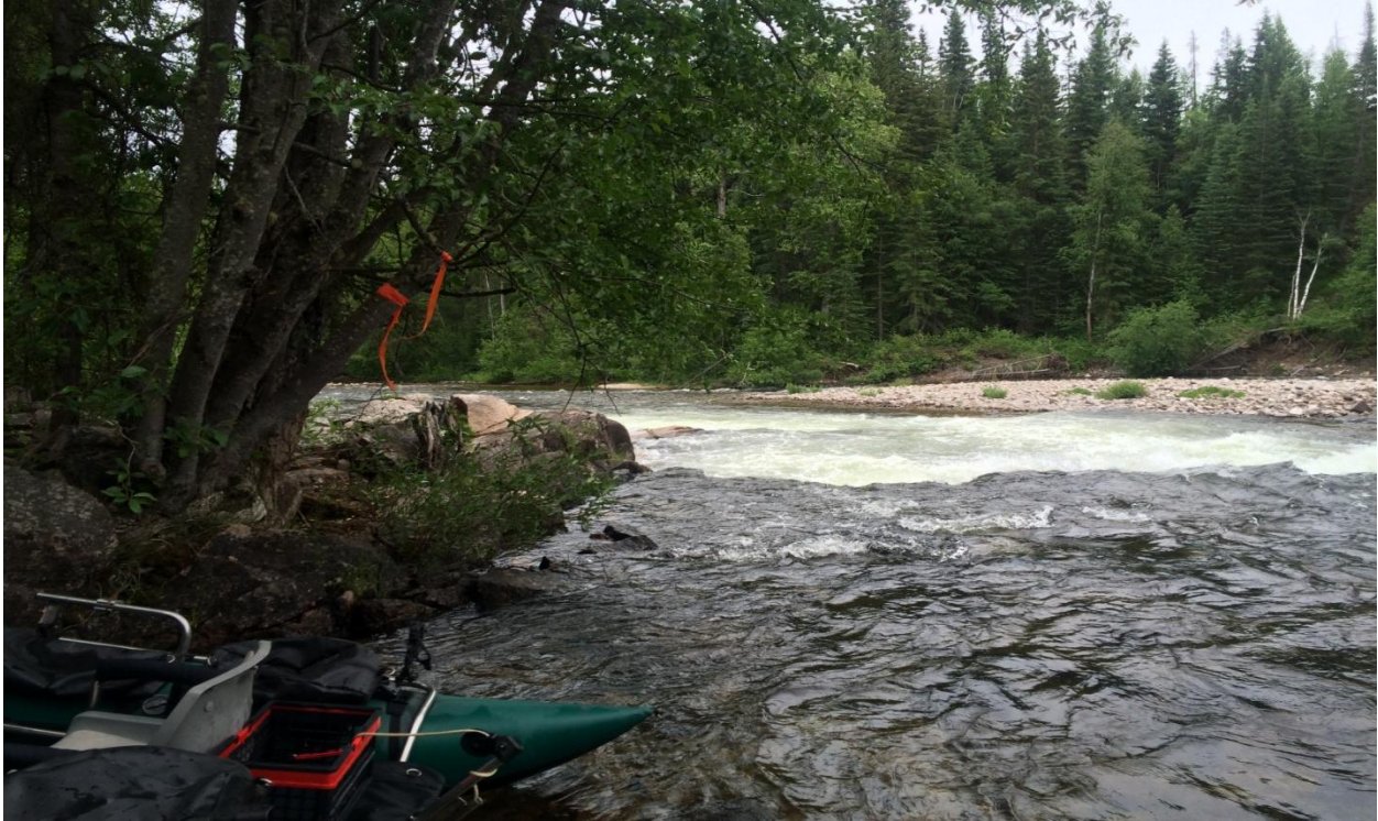
Start of Portage Trail on Left Bank