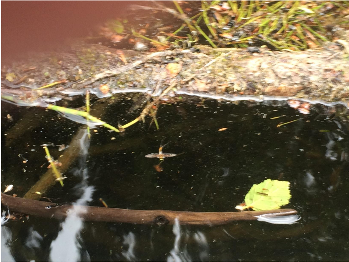
Matching the hatch of Rhithrogena morrisoni (western march browns)