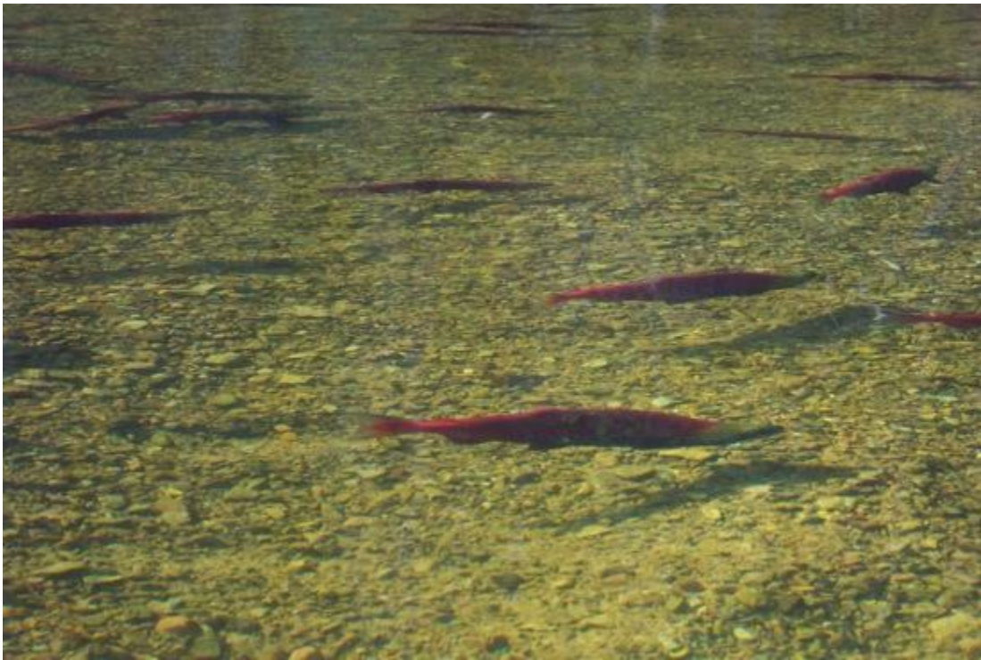
Sockeye spawning in the Stellako River