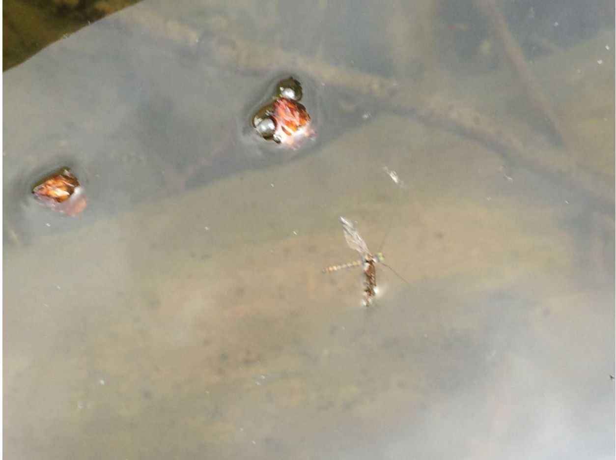
Toads watching a spent spinner (Crane Fly perhaps)