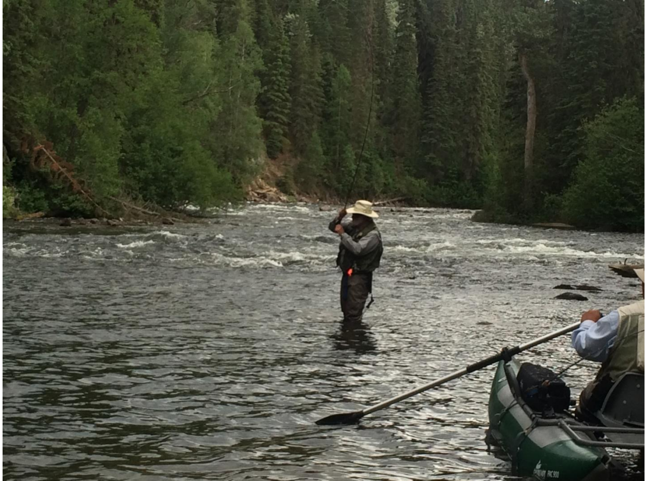
The typical catch at the tail out of a riffle section...

The release.... at https://youtu.be/54GW_uuSjQ8