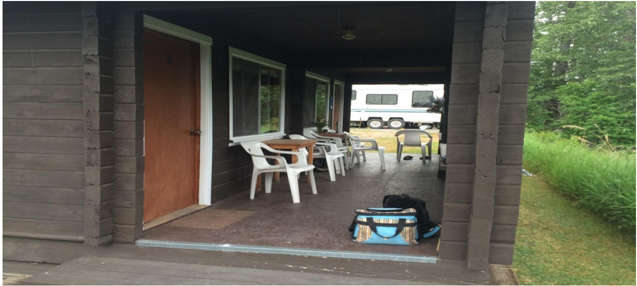
Home away from home with River Front View

As I was close to a week without a shower so I elected to stay in the cabins at the Stellako Lodge, not realizing the Campgrounds had very nice showers also. Wow, flushing toilet, hot water, stove, fridge