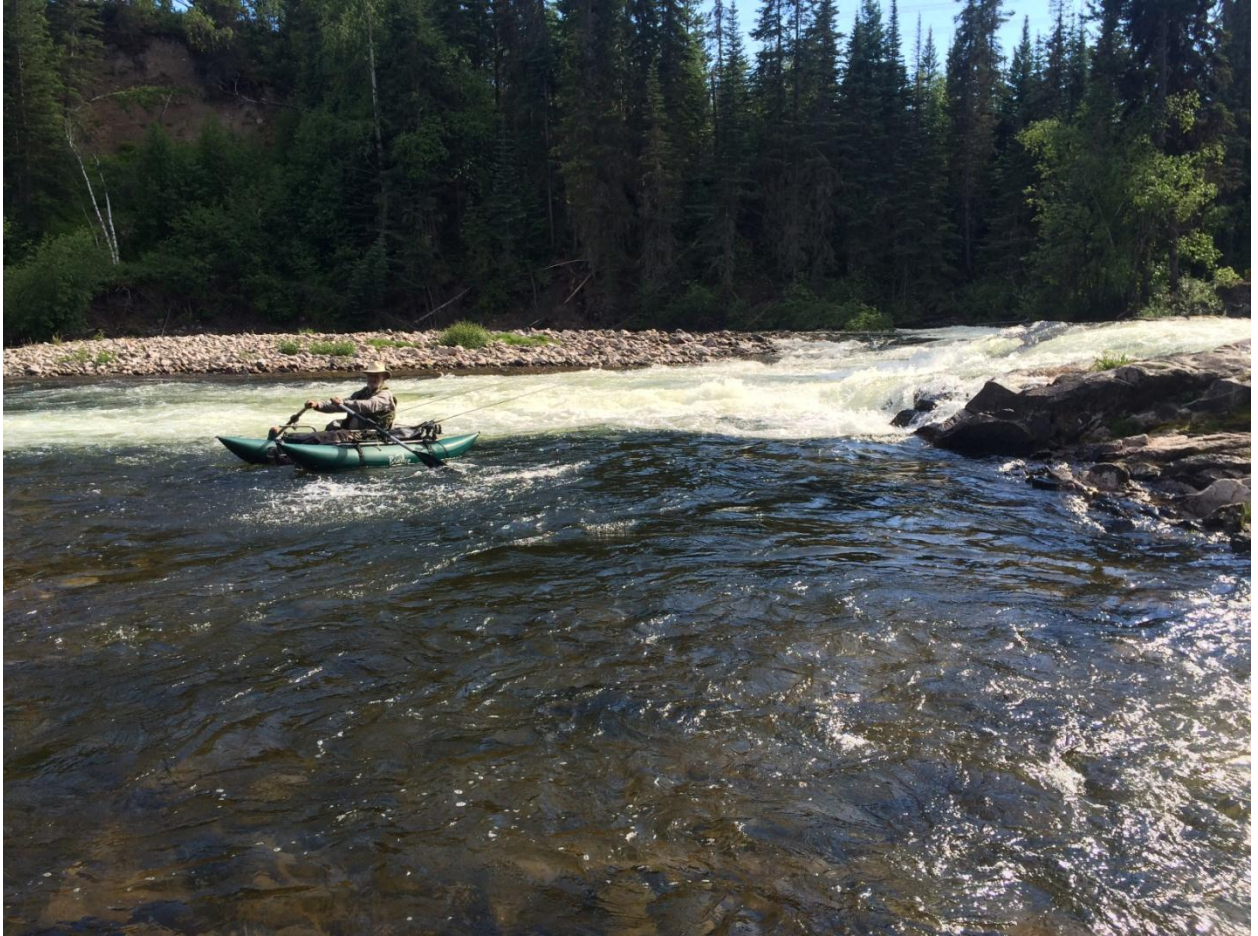
Bob heading out into the current from the bottom end of the Portage Trail