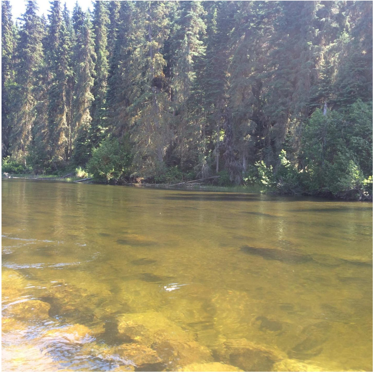
More "Beautifully" Water made for a WaterMaster craft (able to stand on boulders in river) and cast.