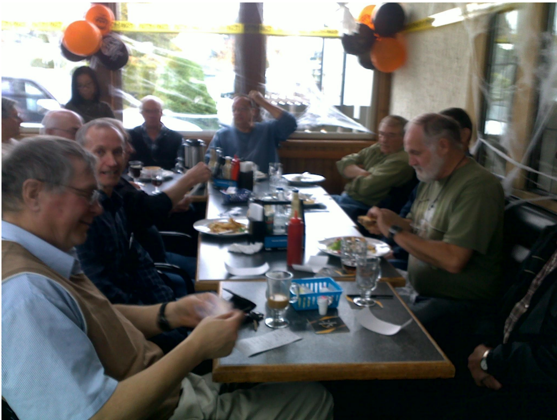
Above: Recent lunch at the Wellington Pub, where you never know what you're going to hear...