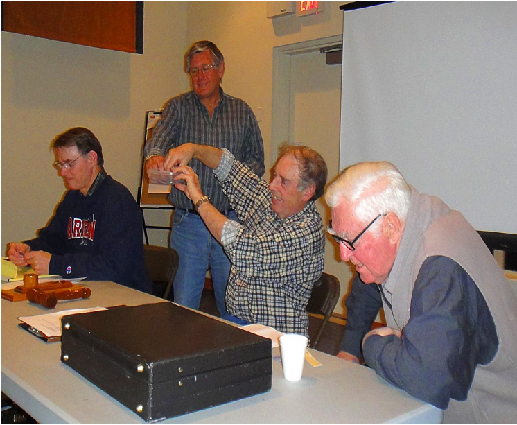
The Gilly Draw