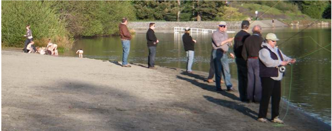
April 14th was a great evening for the casting clinic at Westwood Lake! But, swimming?!