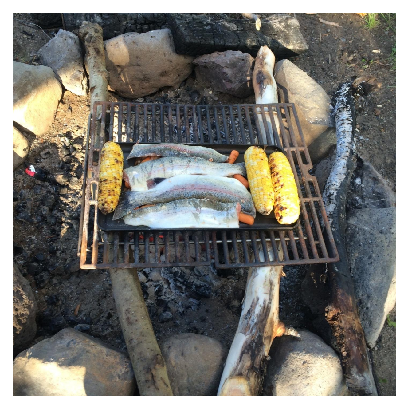
Note the "Loon Scars" on top two trout.