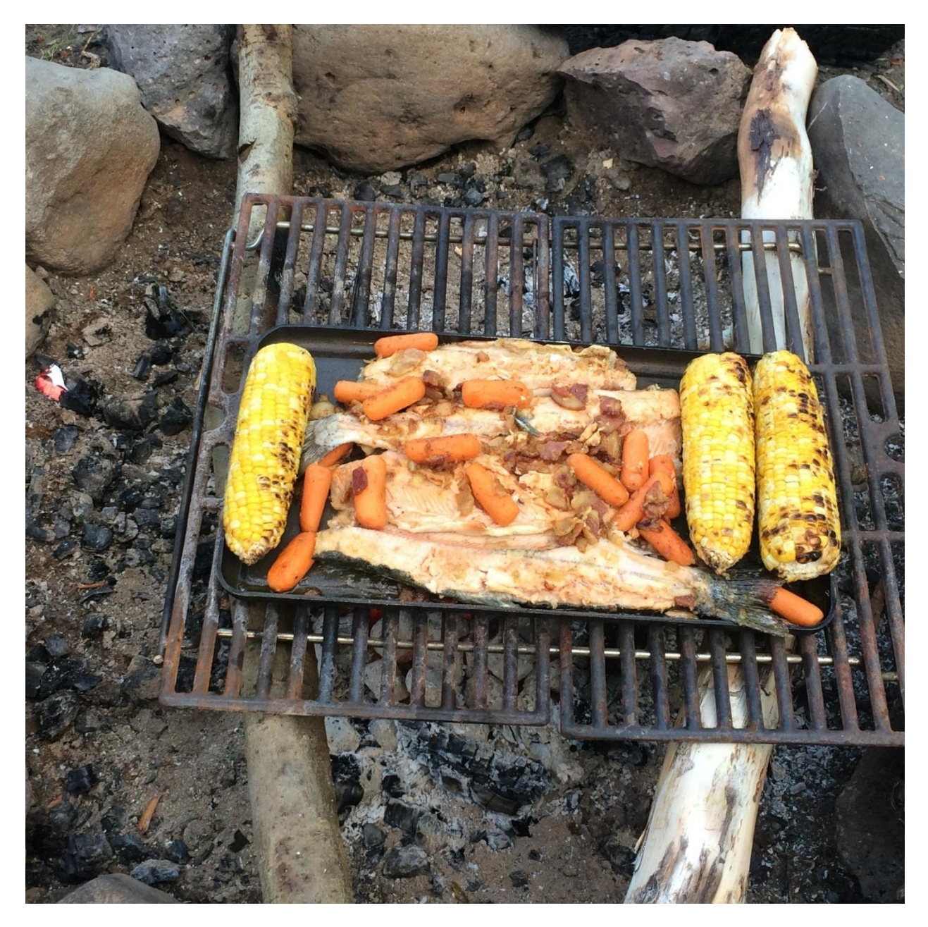
Always good planning to have a gourmet Chef along