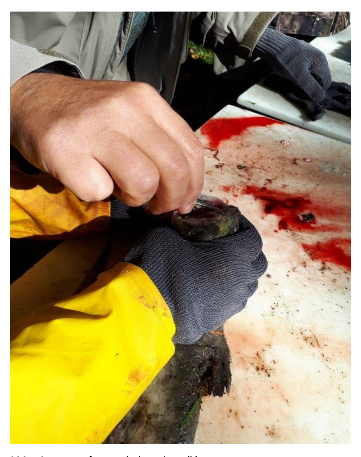
GOOD JOB TEAM unfortunately the patients did not recover.