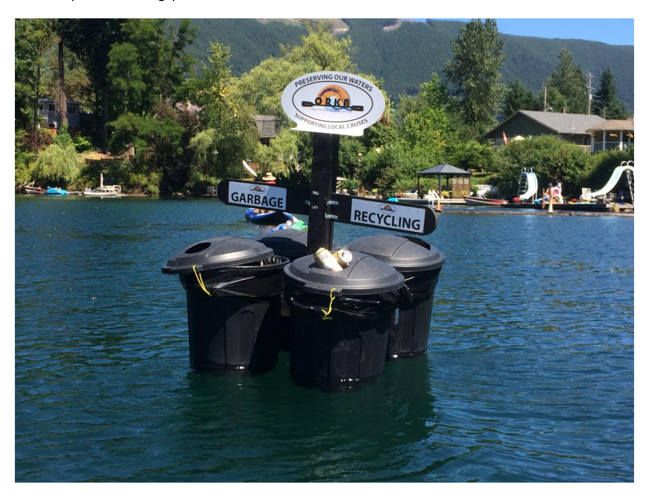
You got to love this community

pools with large boulder cover; ideal for holding spawning salmon and predatory, salmon-egg snatching rainbows during fall and early winter months when we shall return to enjoy the ultimate power of hungry rainbow trout.