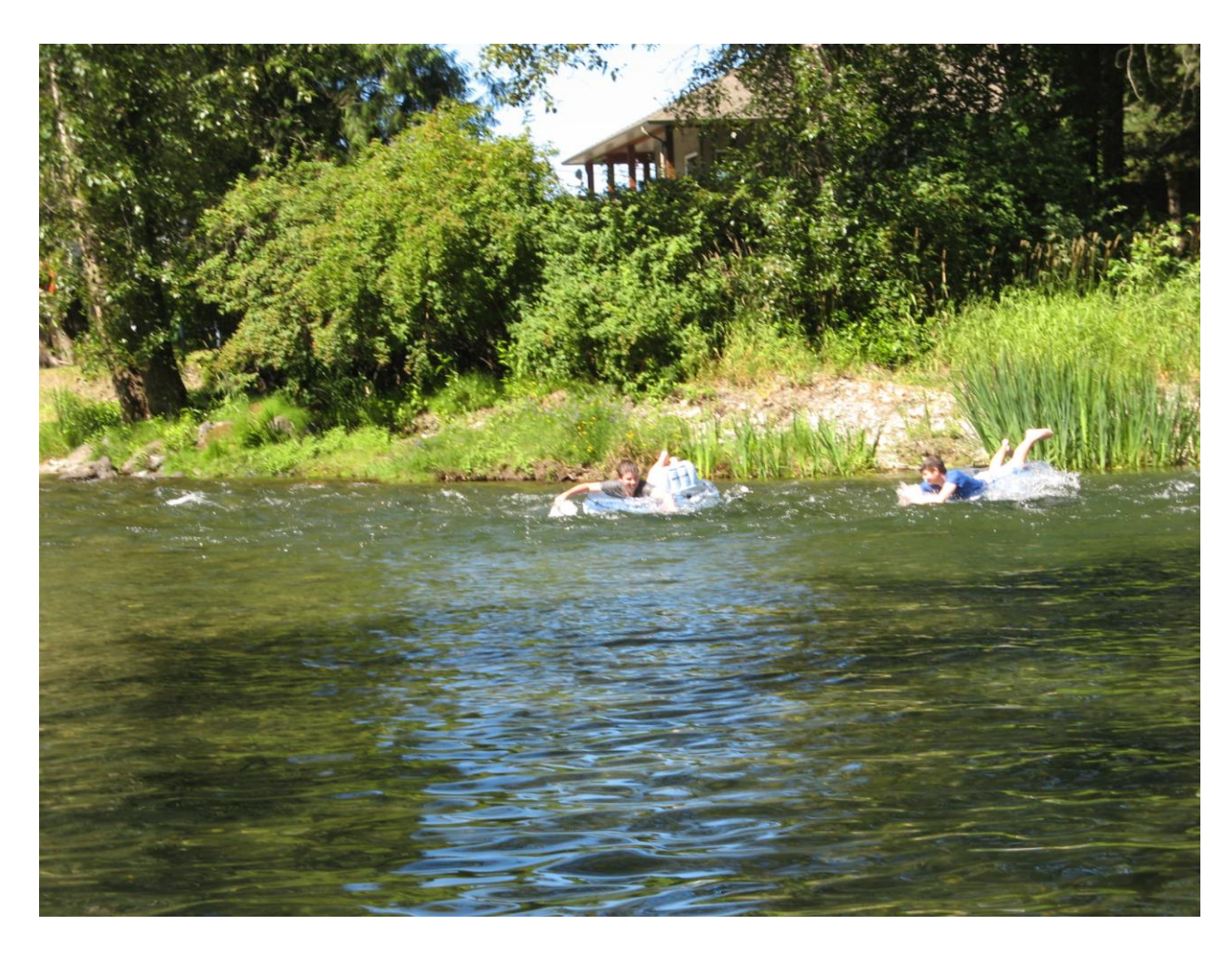
Matt's Grand Kids "dolphining" down the Cowichan