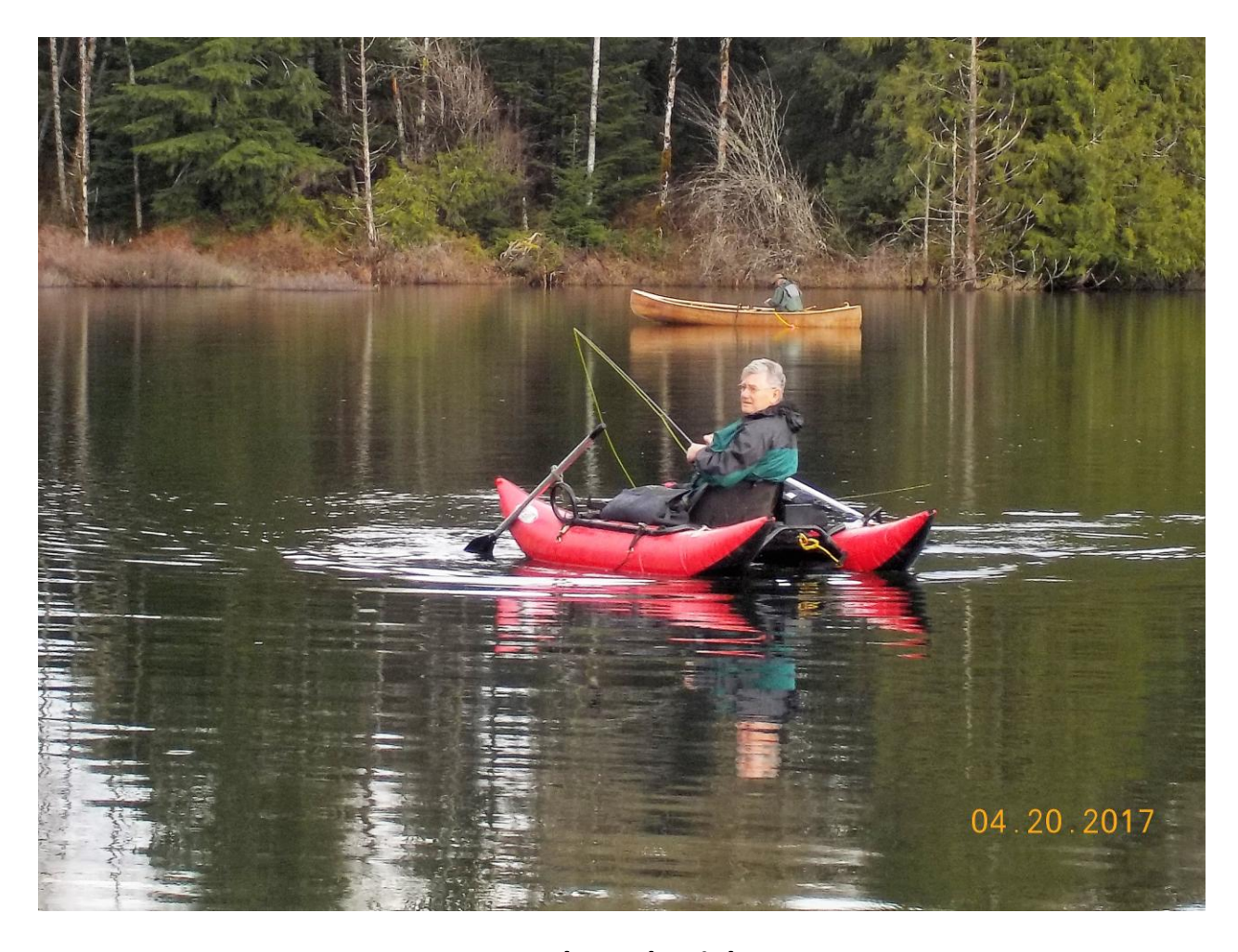
A Don released Rainbow