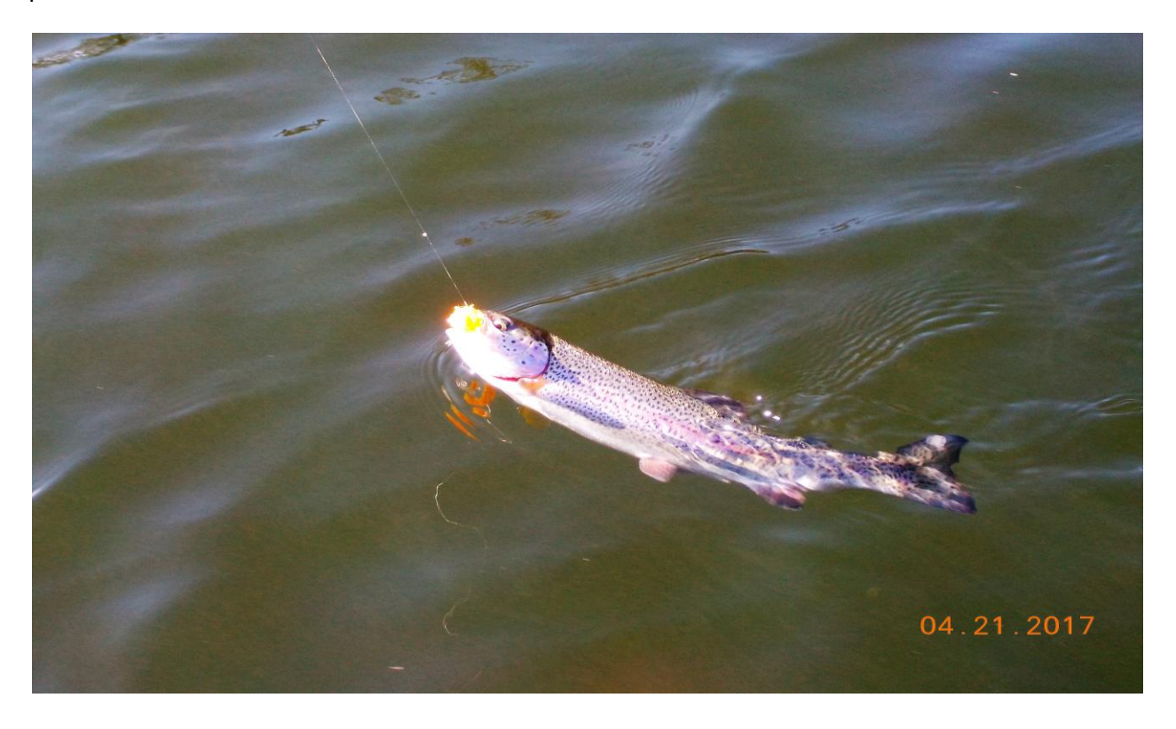
A Blob caught Rainbow

Water temperature for the extended weekend was 10-12 ^{0} C and the fish were actively biting on everything most of the time. Thursday was mainly emerger day when dries were fished both wet and dry and everyone did well. Friday, during a slow period, lan switched to a boobie and/or blob pattern and the bite was back on big time. Then later in the afternoon or evening Jason started fishing a pumpkin head pattern and the bite was continuous through to Saturday afternoon when the rains came and forced all but Matt and Buschie off the lake to start the party. Sunday was another perfectly sunny, calm fishing day for anyone still standing. What happened at Kissinger Lake stays at Kissinger Lake hopefully. In the meantime here are a few pictures to show: