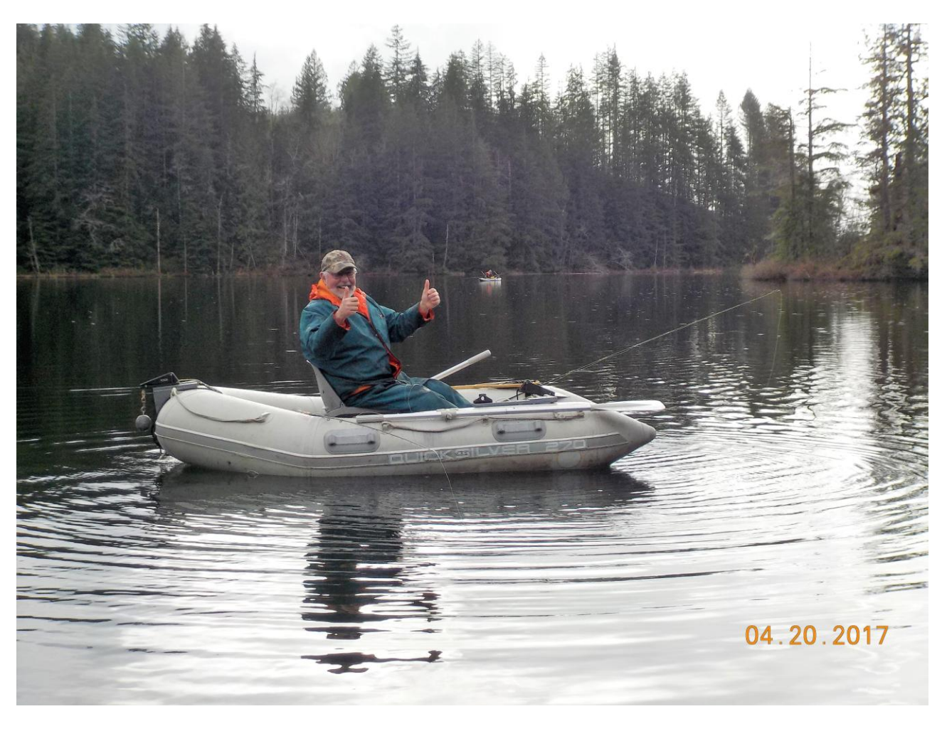
A Jack released Rainbow....his was bigger than all the rest....