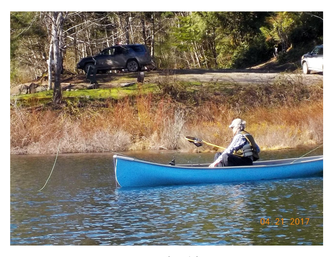
An Ian caught Rainbow