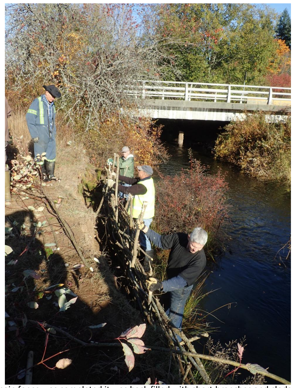
Once the main fence was completed it was back filled with short branches and clods of earth. Finally it was all covered with page wire to prevent the beavers from eating it as they are