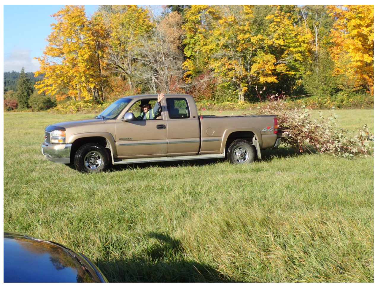
Arrival of the Red Osier Dogwood

The idea was to weave a "wattle fence" using all natural materials. Fairly heavy red osier stakes were first driven about three feet into the ground and then inter woven with long slender red osier limbs.