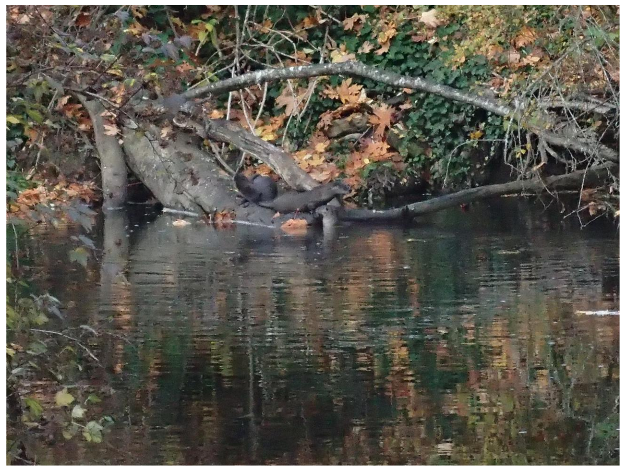
Our next stop was a few km. upstream where the Millstone flows under the East Wellington Rd.