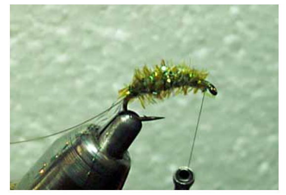
Page 1 of 3