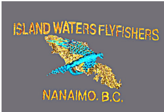
IWFF crest available for members - see p3