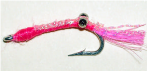
Ed's Pink Krill See page 7 for instructions