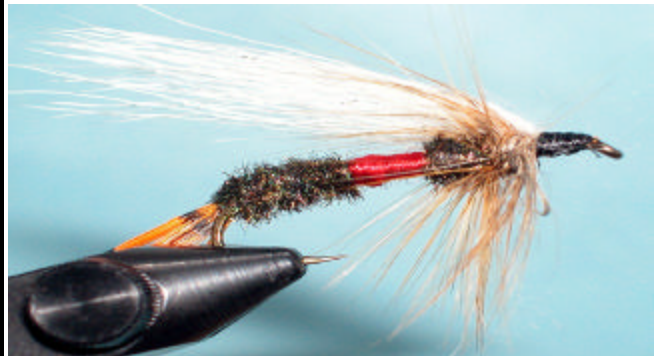
Royal Coachman: See page 6 for instructions

The Island Waters Fly Fishers Box 323, Lantzville, BC V0R 2H0