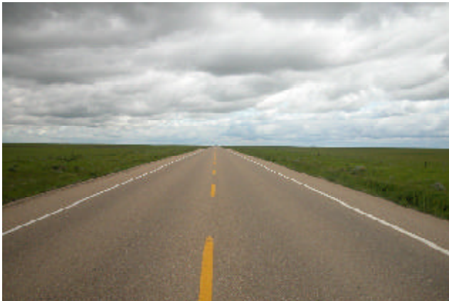
We took the scenic route to Brooks Alberta

After nearly three years since we moved onto the island, we decided to head off to the mainland (offshore as we like to call it). A family gathering scheduled in my home town, Brooks Alberta (south of Calgary), for June 7th, was enough incentive to get our butts out of Nananaimo. As the date approached, the fishing kept getting better and better - even for a novice like me. Why is it that the first two weeks of June is the universal "Best Fishing Month of the Year"? In Alberta this is when the Poplar tree fuzz is drifting in the wind and that is the signal that the Walleye are biting. And that is when my job became hectic and invariably interfered with well laid out plans to go after those voracious Walleye. Despite my bemoaning the lost opportunity on the Cutthroats, we did have a good time. One of the highlights of the trip was our journey through Southern Alberta - as depicted by the photograph.