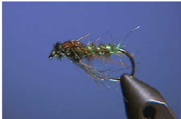
Caddis Pupa Page 5