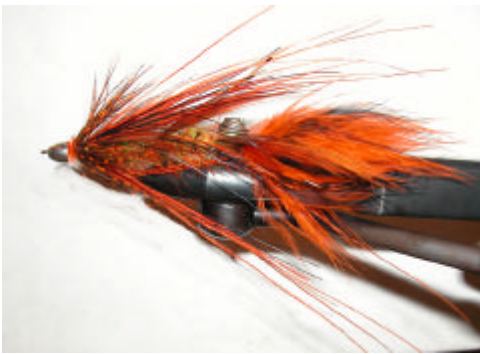
Joie Coe's demo fly at the BCFFF AGM

The Island Waters Fly Fishers Box 323, Lantzville, BC V0R 2H0