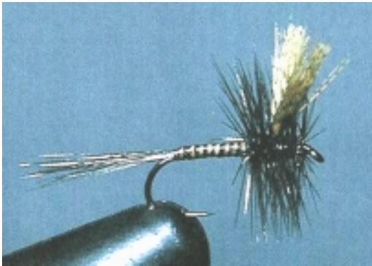
Quill Gordon: See page 4

The Island Waters Fly Fishers Box 323, Lantzville, BC V0R 2H0