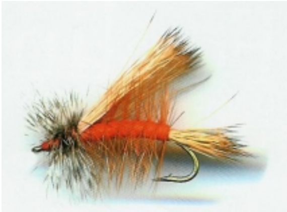
Orange Stimulator: See page 4