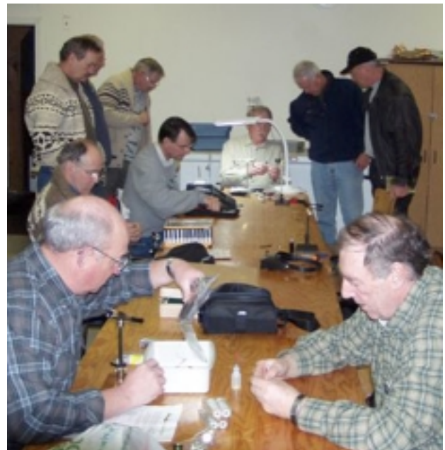
Basic Fly Tying Class after the February 22nd Meeting.

Saturday, November 26, 2005 at the Lantzville Legion.