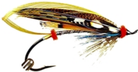
Silver Doctor - page 4