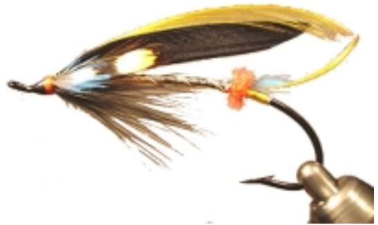
Nighthawk - page 4

Tie them up and bring them to the next meeting!