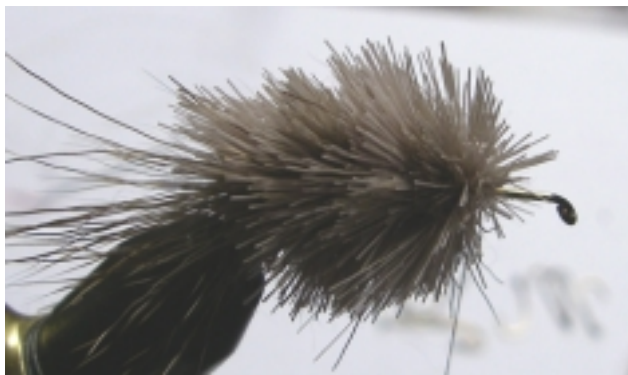
A Gomphus in progress - an all deer hair fly.