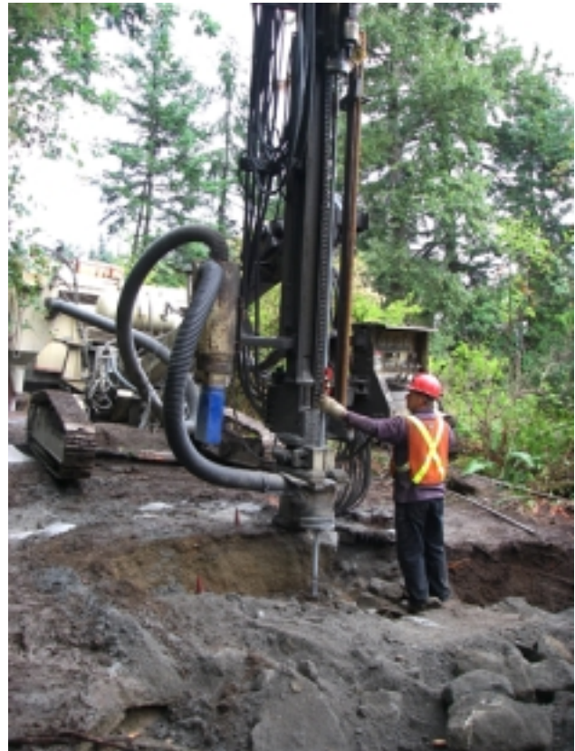
The driller checks the levels before drilling another blast hole for dynamite in the channel near the Millstone River.