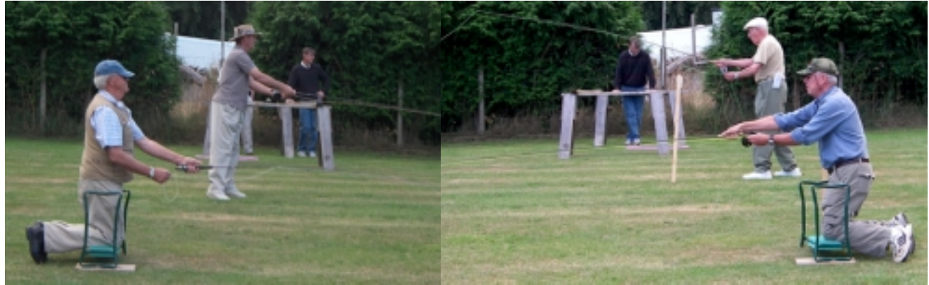
Duelling Casters: The Danish Casting Game was played twice last summer. See pages 4 and 8.