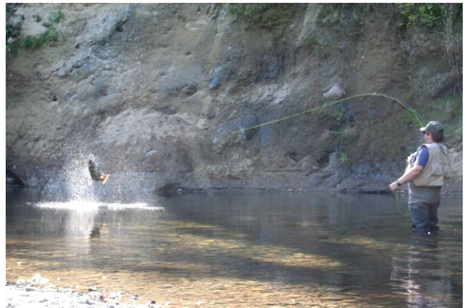
Bruce Cumming wrestles in his 25 lb. buck chinook caught on his favourite blue salmon fly. The picture was photographed by a professional photographer/tourist from the Netherlands who was at the bridge of the Little Qualicum River. It took 20 minutes to land and must have jumped eight times!