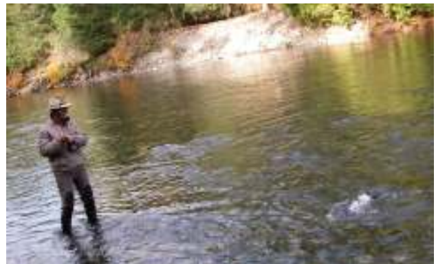
Gerry lands another chum

This year the Island Waters Fly Fishers went on two fishouts on the Nanaimo River. The first one was about a kilometre down stream of the No. 1 Highway Bridge and the second one was close to the estuary on October 27th, the day after this area was opened to fishing. Both pools and many in between had an abundance of chum this year.